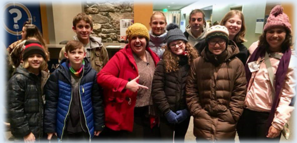
The youth attended a "Follow the Star" journey at Conner Prairie

November was an exciting and busy month for RE. Here are some highlights: