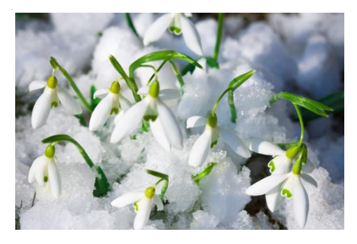
Candlemas Bells, or Snowdrops, a symbol of hope and purification in some religions.