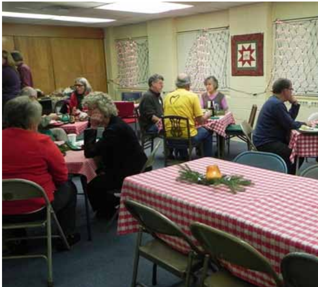
Seating above the fellowship hall added more room for Trudy's Café.