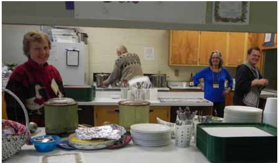
Saturday morning café workers cheerful as always!