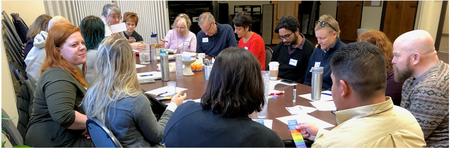
Participants in the first UUCTC Membership Class of 2019