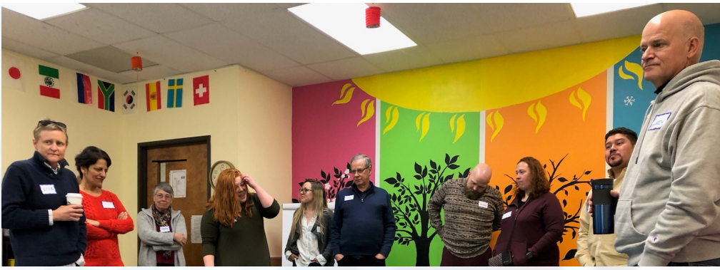
Membership Class Members touring the UUCTC building